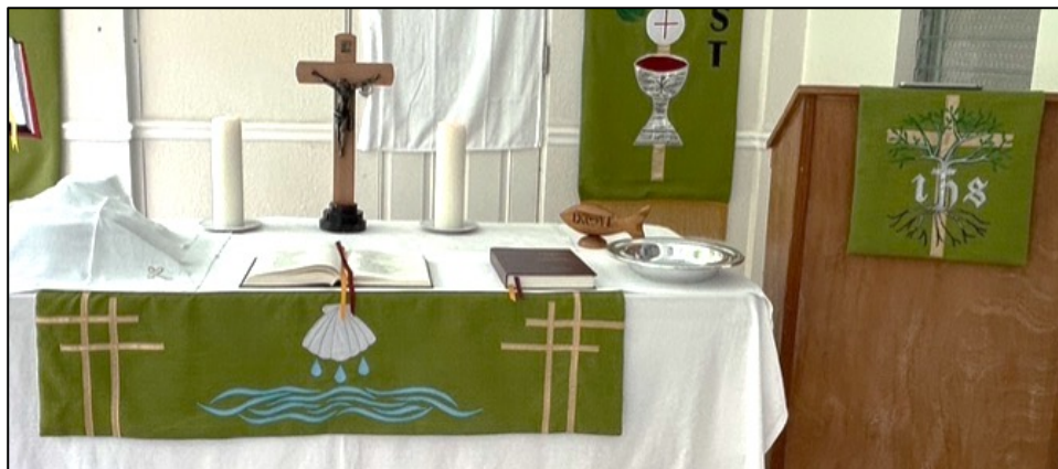
New Reformation & Season After Pentecost paraments. Potluck and home-service slideshow.