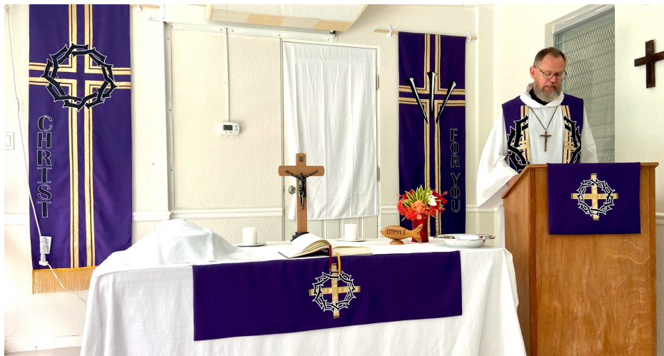
The new paraments and the new stole matching the banners made new last year.