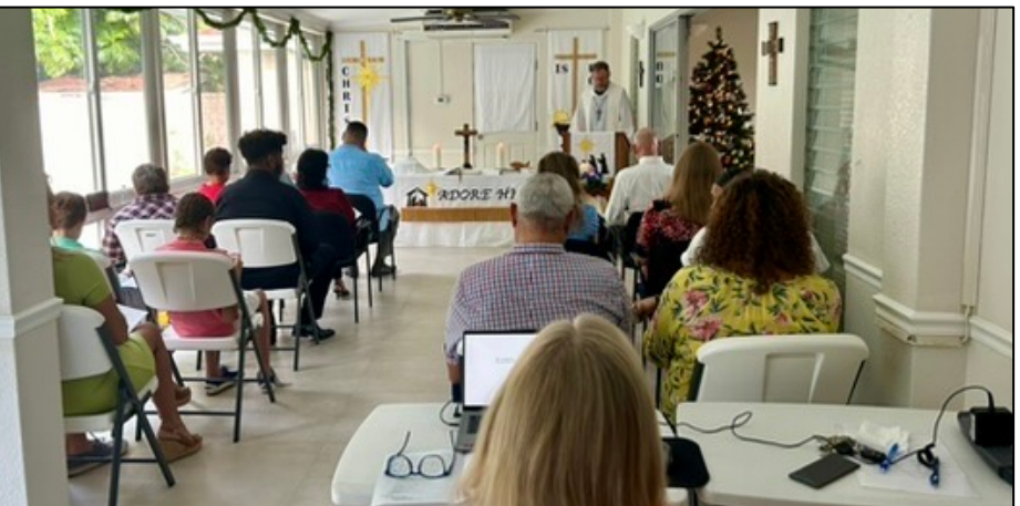
A full house on Christmas Day! Teaching seminary students online in Spanish (below).